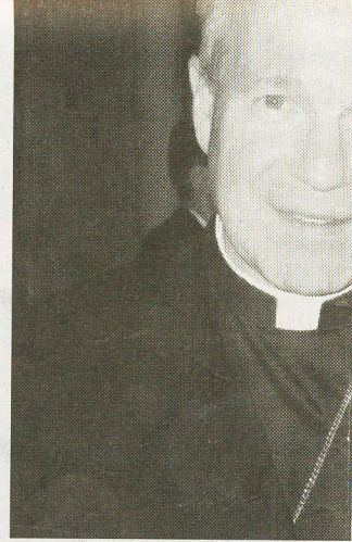
Cardinal Christoph Schönborn