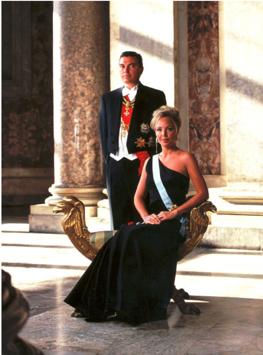
The Grand Master HRH Prince Charles of Bourbon Two Sicilies, Duke of Castro, and HRH Princess Camilla of Bourbon Two Sicilies, Duchess of Castro,