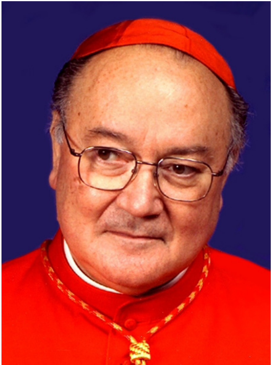
His Eminence Renato Raffaele, Cardinal Martino, Grand Prior of the Sacred Military Constantinian Order of Saint George