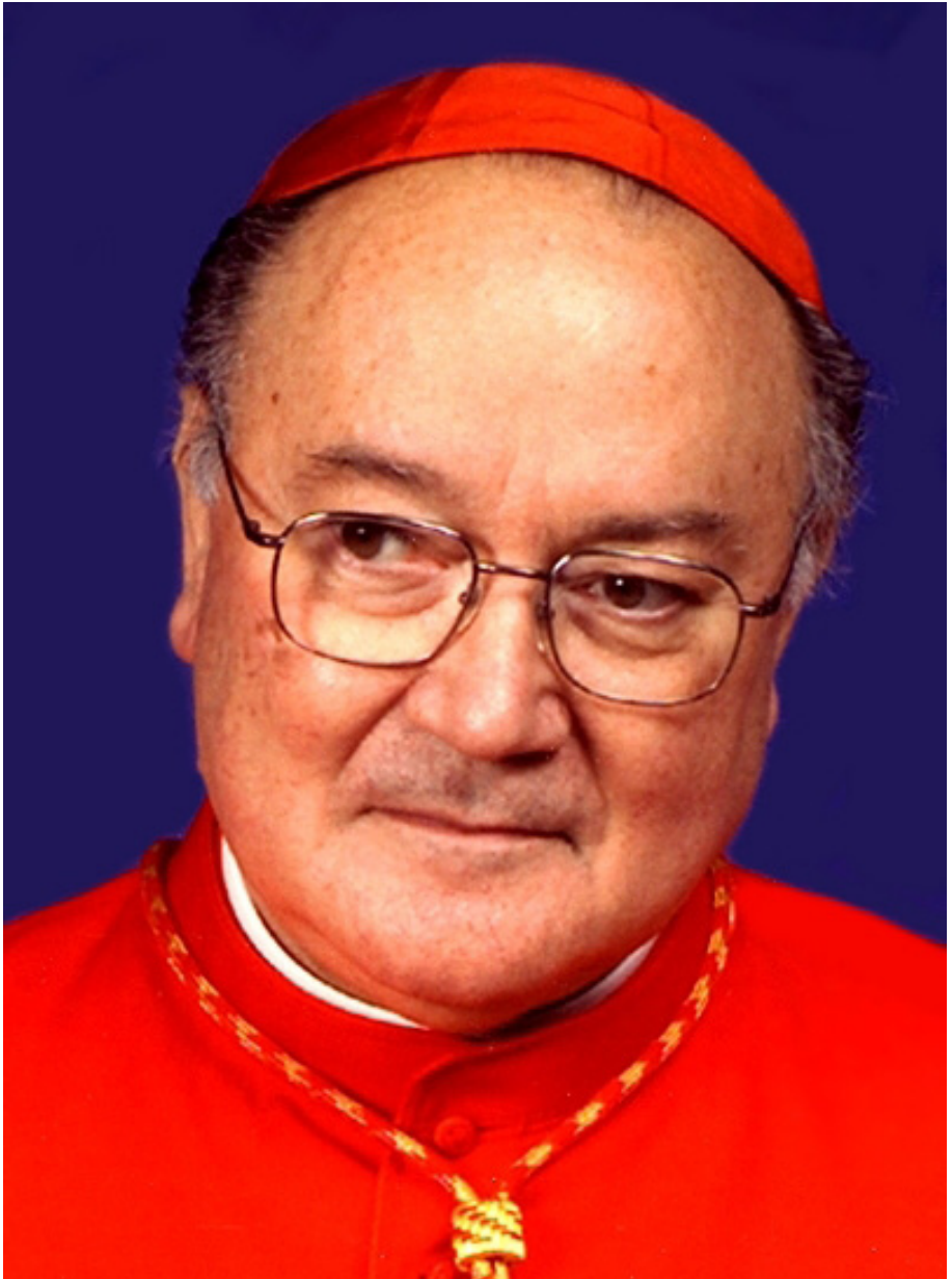
His Eminence Renato Raffaele, Cardinal Martino, Grand Prior of the Sacred Military Constantinian Order of Saint George