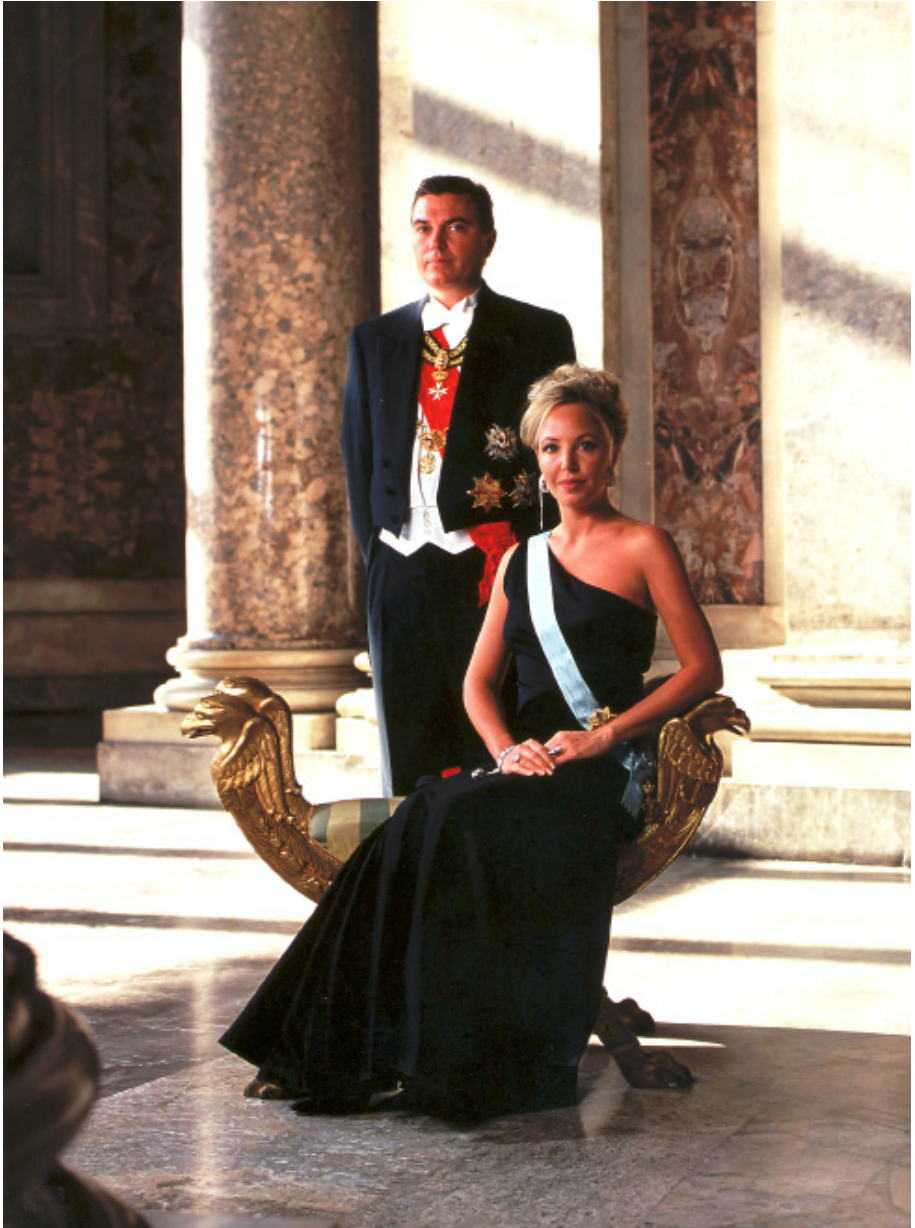
The Grand Master HRH Prince Charles of Bourbon Two Sicilies, Duke of Castro, and HRH Princess Camilla of Bourbon Two Sicilies, Duchess of Castro,